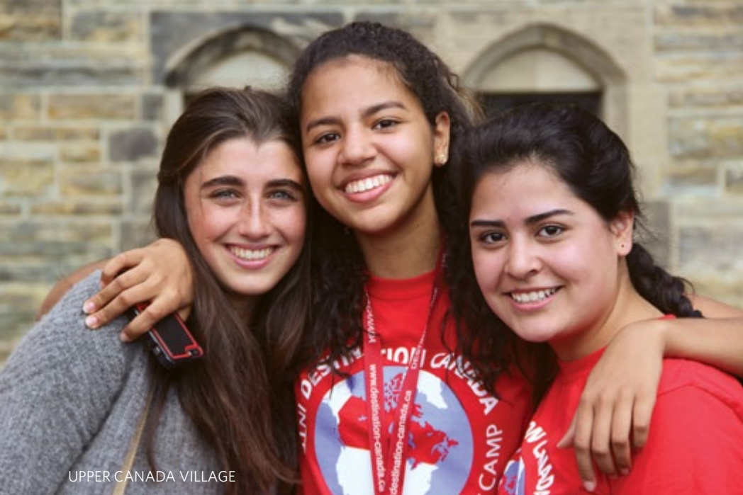
UPPER CANADA VILLAGE